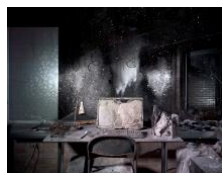
Still in Life, 2014