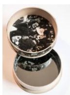
Cosa ne pensi del movimento femminista?, 1974