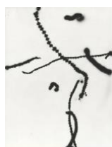
L6, detta Profilo, 1991. From the series Lucciole, 1988-1991