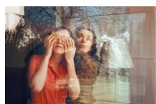
Self Portrait with My Mother, 2011

Press tour: Thursday, January 30, 2020, 12 noon