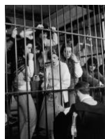
Le ragazze di Prima Linea. Torino, 1981