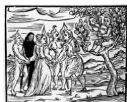
Il ballo. From the series »Le streghe«. 1975-76

Press tour: Thursday, January 30, 2020, 12 noon