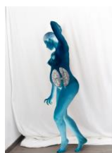
Medusa, 2014. From the series »The Modern Spirit is Vivisective«

Press tour: Thursday, January 30, 2020, 12 noon