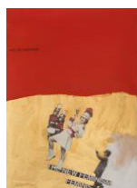
The New Feminism, 2016