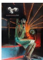
La fine delle illusioni, 2002