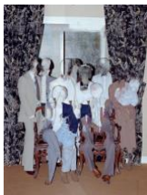
Family portrait at the wedding - Archive from year 85

Extract from Tropism, Consequences of a displaced Memory, study one, 2016–2021