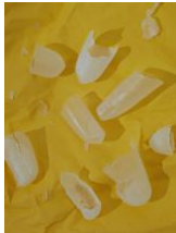
Sharpe Tongue, Round Fingers, 2017

Venue: Fotografie Forum Frankfurt, Braubachstr. 30–32, 60311 Frankfurt