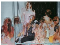
Home in Gia Dinh - Archive from year 72

Extract from Tropism, Consequences of a displaced memory, study one, 2016–2021