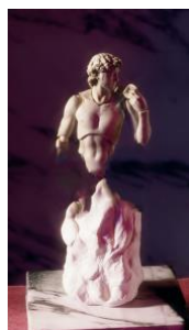
The Flawed Ones Were Cheaper (2), 4K-Video, 2018