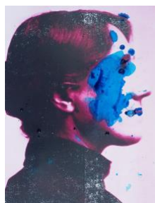
Onus Probandi. From the series “Intercepted”, 2017

Press tour: Friday, November 30, 12 noon