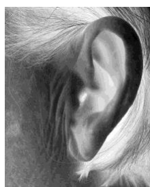
Careless Talk #1. From the series “Intercepted”, 2017