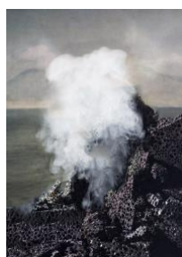
We Went To A Crater, 2018