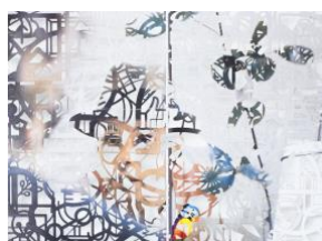
Our Writing Tools Take Part In The Forming Of Our Thoughts, 2017 (Detail)