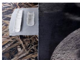
How To Get In Touch (impressed by nature's hand/Talbot), 2017