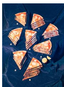
We Went To That Pizza Place Display Was Not Exaggerating! (Marine Biology, Ocean Still Life/Spoof: Unlikely), 2018

Press tour: Friday, November 30, 12 noon