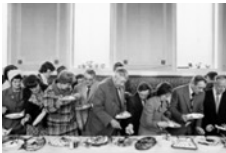
Mayor of Todmorden's inaugural banquet, Todmorden, West Yorkshire, England, 1977