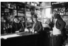
Lynotts Bar, Manorhamilton, County Leitrim, Ireland, 1983