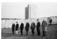
Rugby League Club ground, West Yorkshire, England, 1977