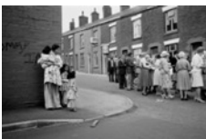
St Peter's Walks, Bolton, Greater Manchester, England, 1979