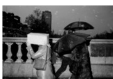
O'Connell Bridge, Dublin, Ireland, 1981