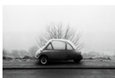
Elland, West Yorkshire, England, 1978