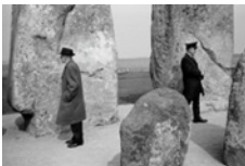
Stonehenge, Wiltshire, England, 1976