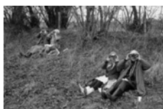
Surrey Bird Club, Surrey, England, 1972

Exhibition venue: Fotografie Forum Frankfurt