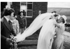
Wedding at Crimsworth Dean Methodist Chapel, Hebden Bridge, Calderdale, West Yorkshire, England, 1977