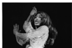
Barbara Klemm Tina Turner, Frankfurt, 1971