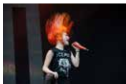
Hayley Williams, Paramore Rock im Park, Nürnberg, 2013