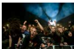
Fans bei Korn Rock am Ring, Nürburgring, 2009