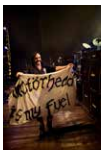
Pep Bonet Mötörhead South American Tour, 2010 from the series » Roadkill – Motörhead «