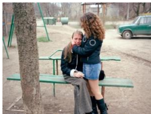
From the series "Aids in Odessa", 2009