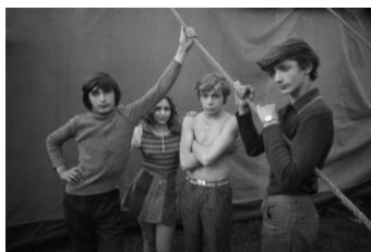
From the series "Zusammenleben", Aue, 1973