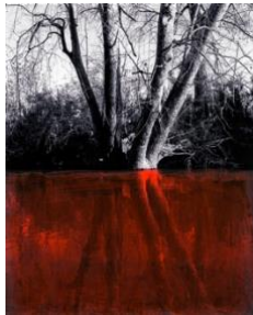
Choccolocco Creek, West Aniston, Alabama, 2012