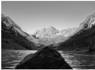
Maroon Bells, Sunrise, 2012